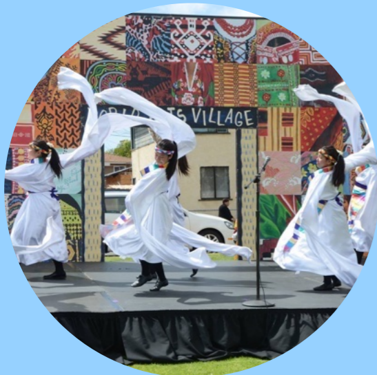
2 Stages of Multi-Cultural Entertainment Representing 15+ Cultures