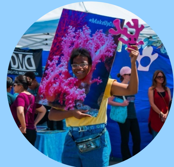
Carnival Zone, Kid's Zone, and Numerous Interactive Learning Experiences

The Linda Vista Multi-Cultural Fair is recognized as the neighborhood's largest multi-cultural celebration!