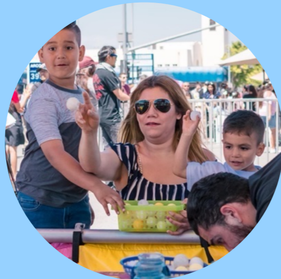
Family-Friendly Multi-Generational Atmosphere & Activities